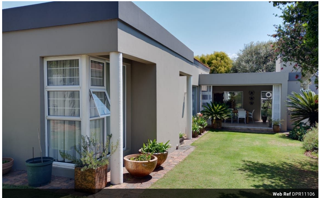
Web Ref DPR11106

18 Klipriver Drive Three Rivers Vereeniging