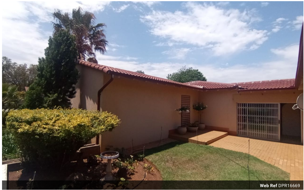
Web Ref DPR16669

18 Klipriver Drive Three Rivers Vereeniging