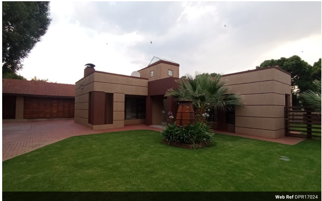
Web Ref DPR17024

18 Klipriver Drive Three Rivers Vereeniging