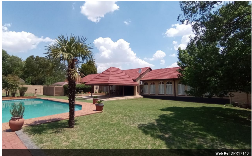
Web Ref DPR17140

18 Klipriver Drive Three Rivers Vereeniging