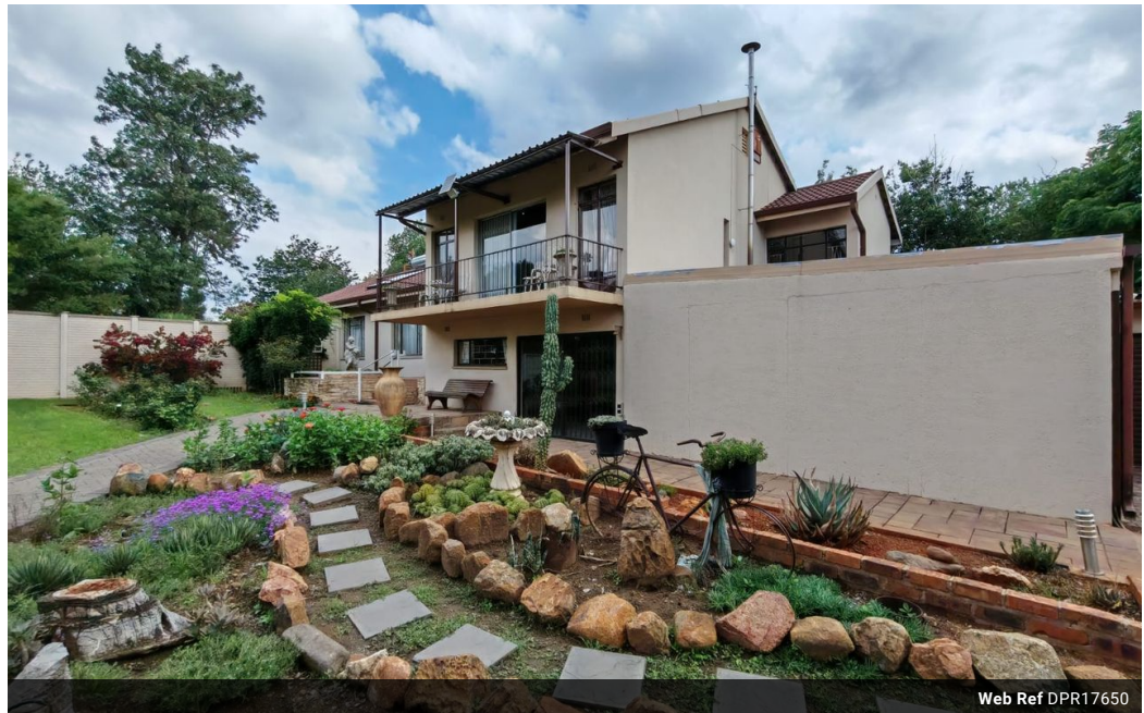
Web Ref DPR17650

18 Klipriver Drive Three Rivers Vereeniging