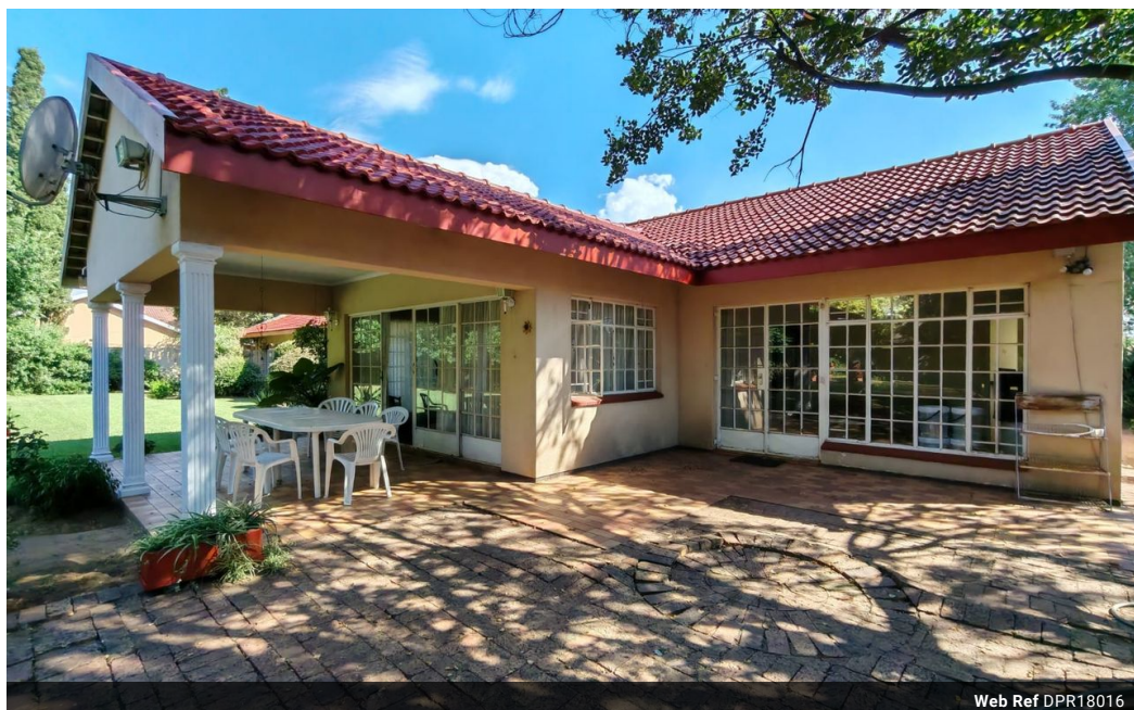
Web Ref DPR18016

18 Klipriver Drive Three Rivers Vereeniging