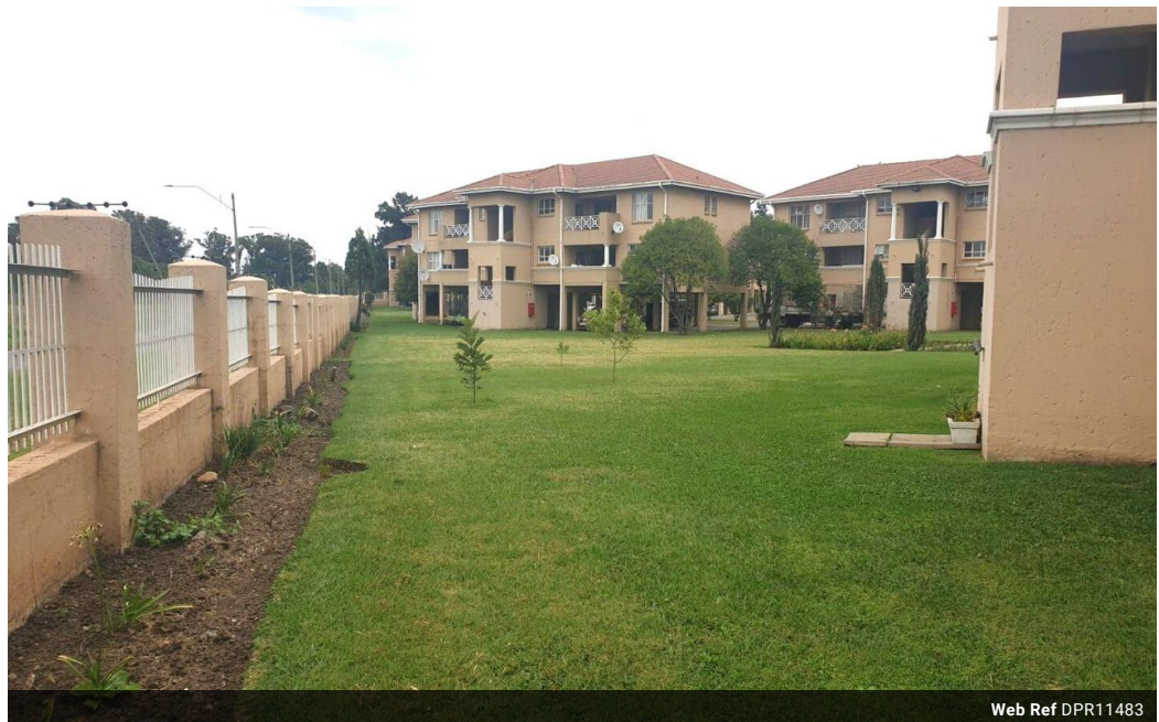
Web Ref DPR11483

18 Klipriver Drive Three Rivers Vereeniging