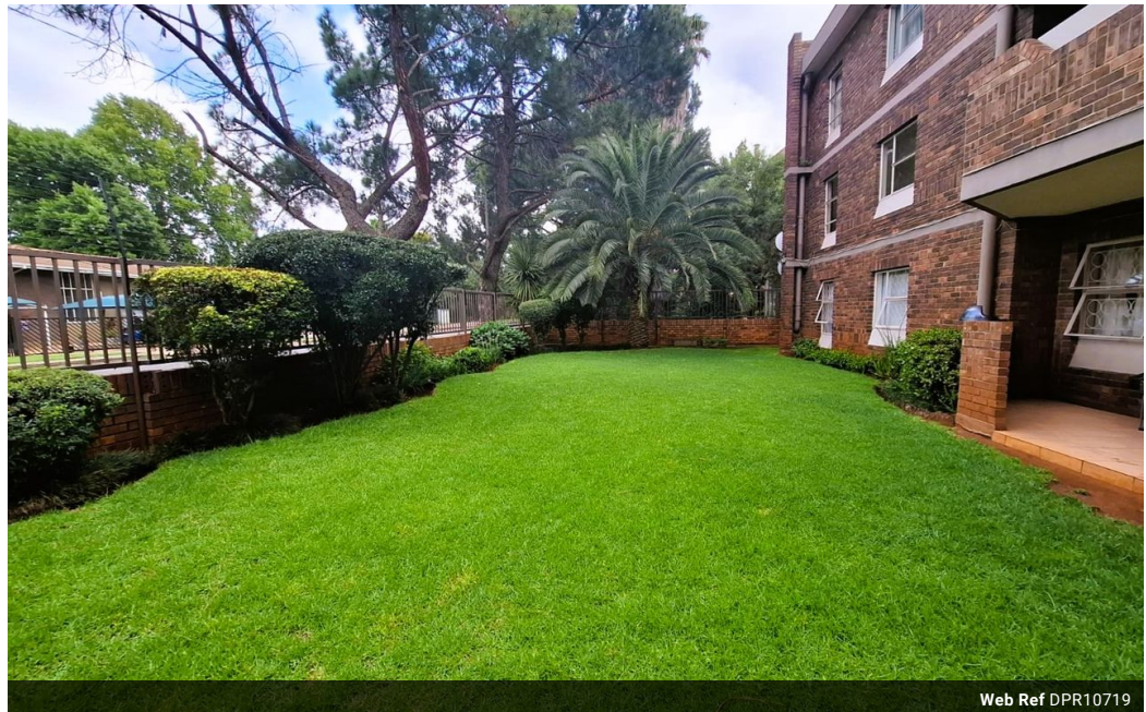
Web Ref DPR10719

18 Klipriver Drive Three Rivers Vereeniging