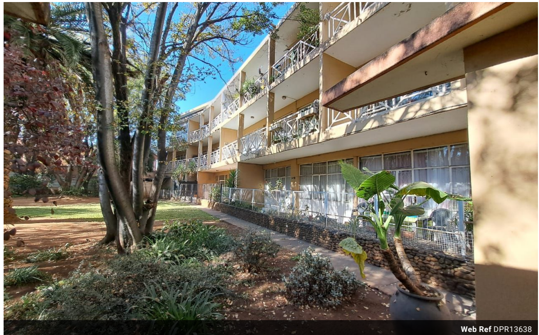
Web Ref DPR13638

18 Klipriver Drive Three Rivers Vereeniging