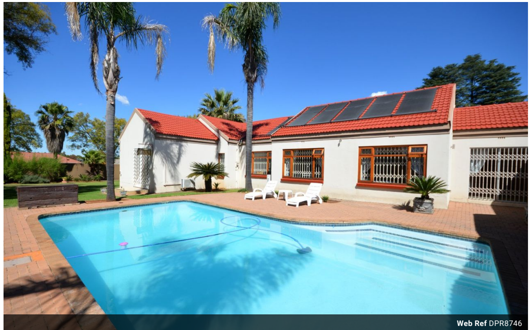
Web Ref DPR8746

18 Klipriver Drive Three Rivers Vereeniging