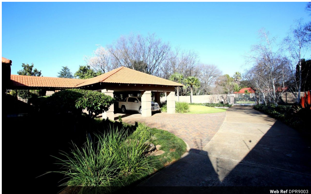
Web Ref DPR9003

18 Klipriver Drive Three Rivers Vereeniging