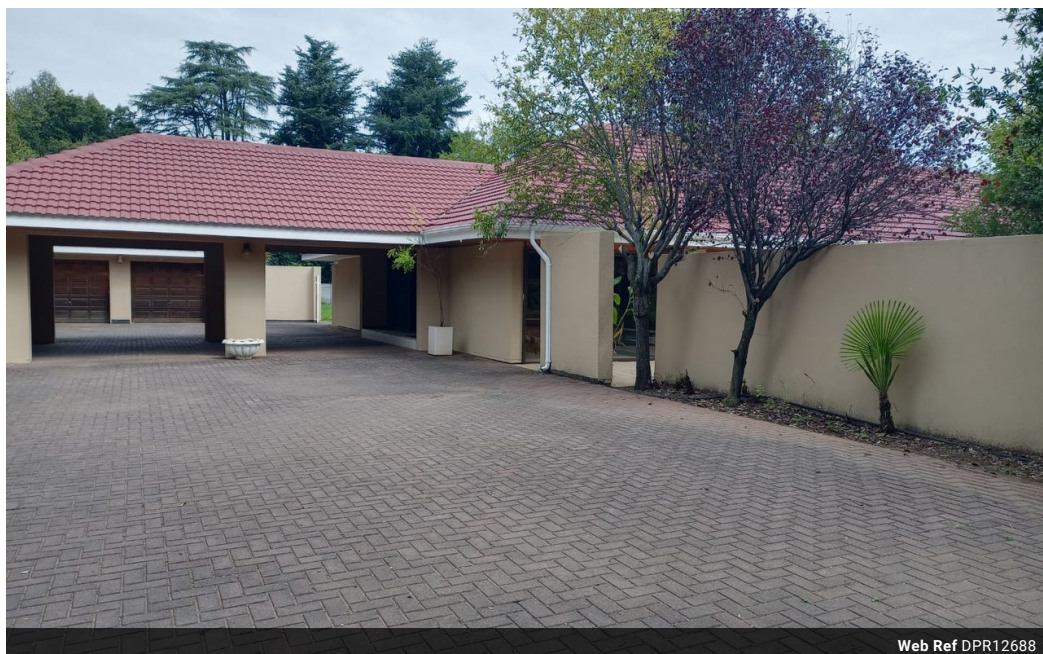
Web Ref DPR12688

18 Klipriver Drive Three Rivers Vereeniging