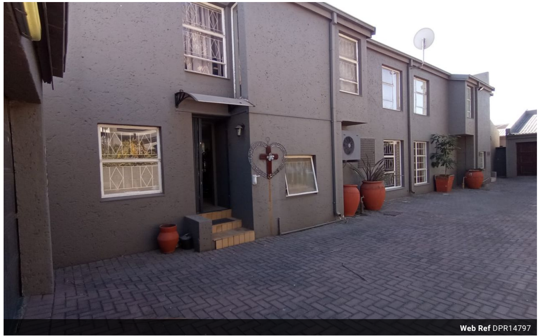
Web Ref DPR14797

18 Klipriver Drive Three Rivers Vereeniging