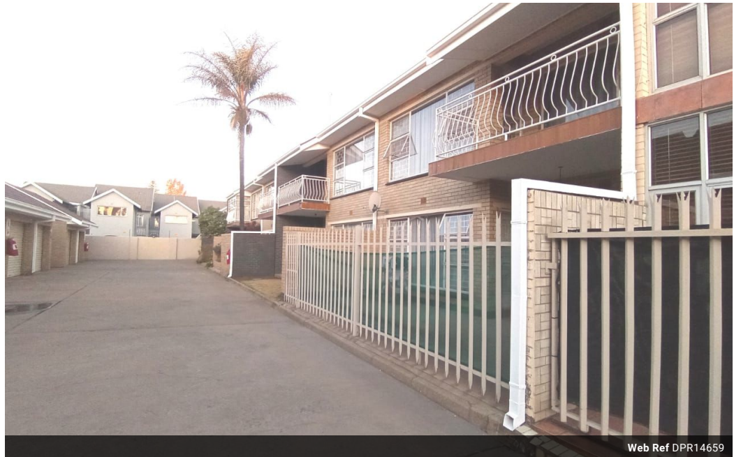
Web Ref DPR14659

18 Klipriver Drive Three Rivers Vereeniging