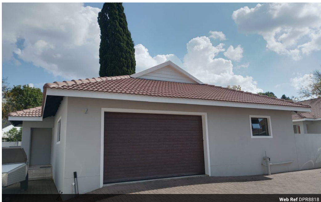
Web Ref DPR8818

18 Klipriver Drive Three Rivers Vereeniging