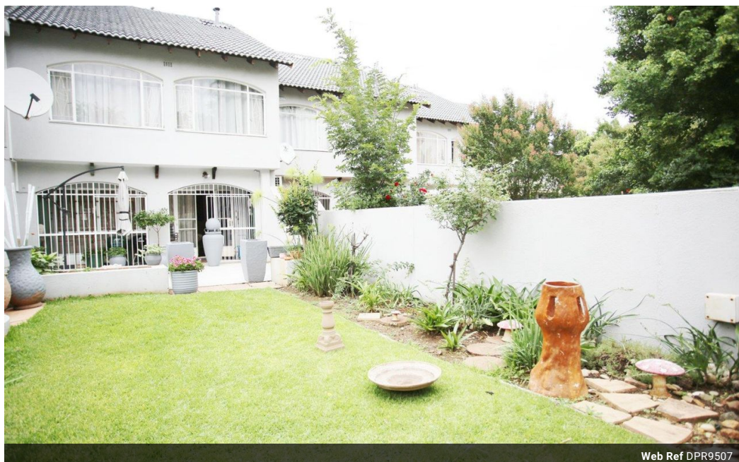
Web Ref DPR9507

18 Klipriver Drive Three Rivers Vereeniging