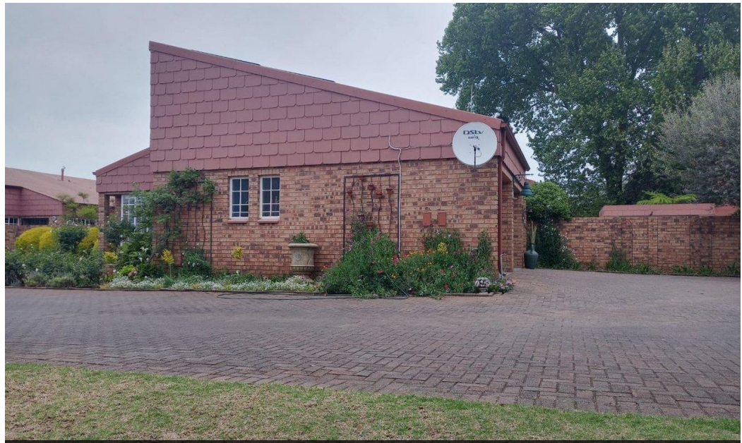
Web Ref DPR10992

18 Klipriver Drive Three Rivers Vereeniging