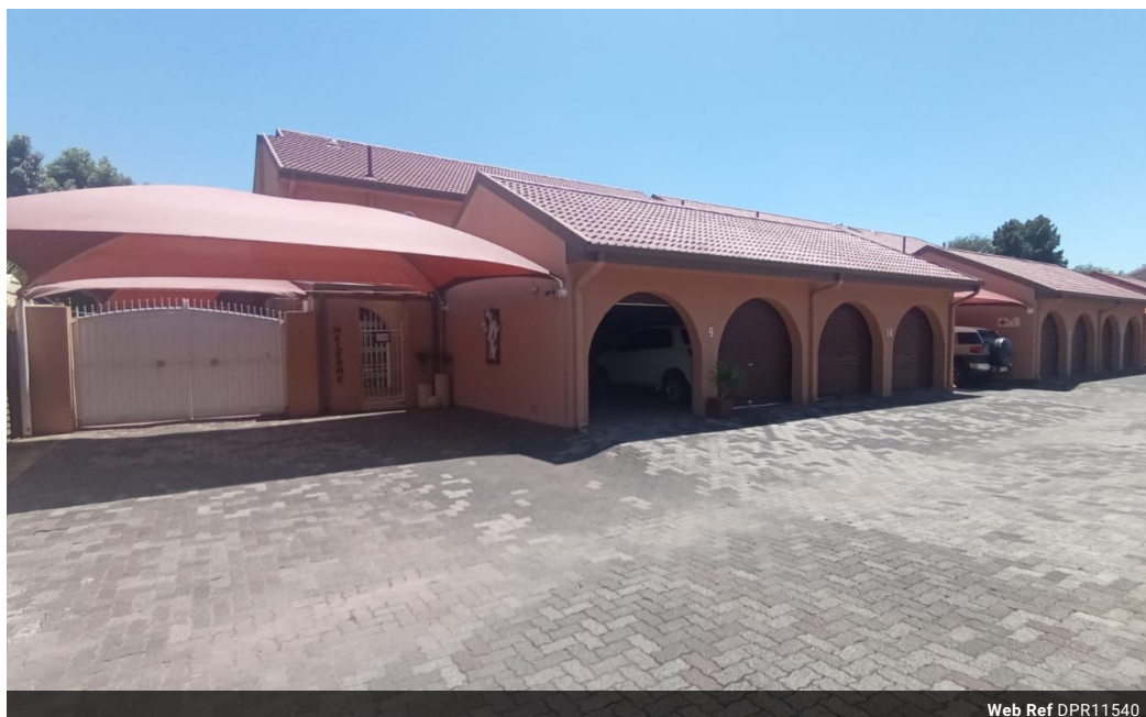
Web Ref DPR11540

18 Klipriver Drive Three Rivers Vereeniging