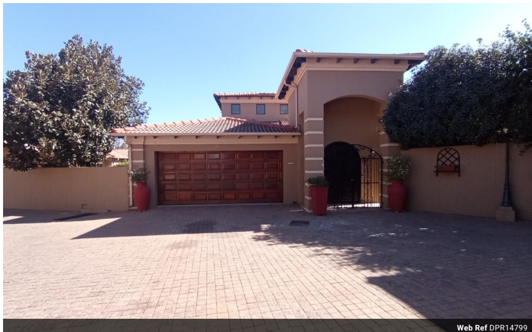
Web Ref DPR14799

18 Klipriver Drive Three Rivers Vereeniging