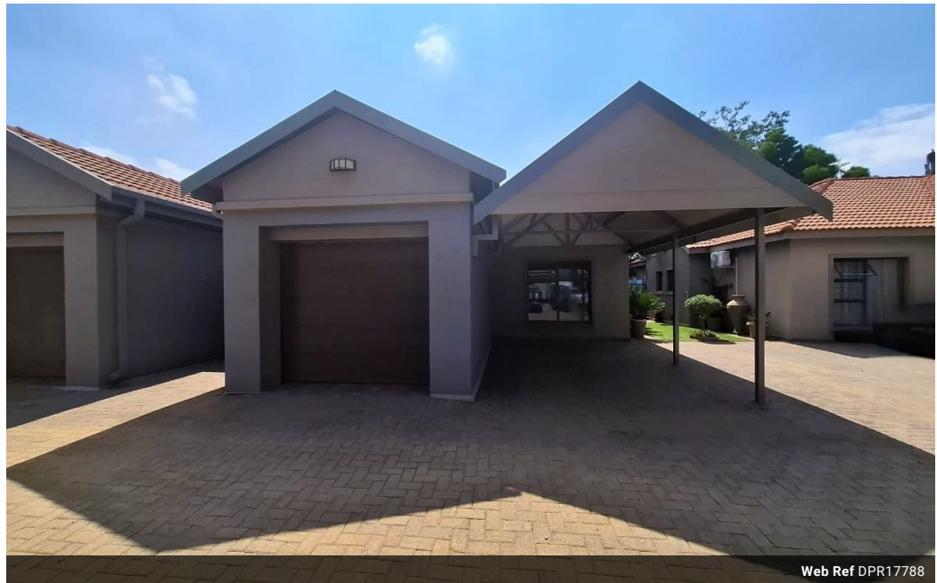
Web Ref DPR17788

18 Klipriver Drive Three Rivers Vereeniging