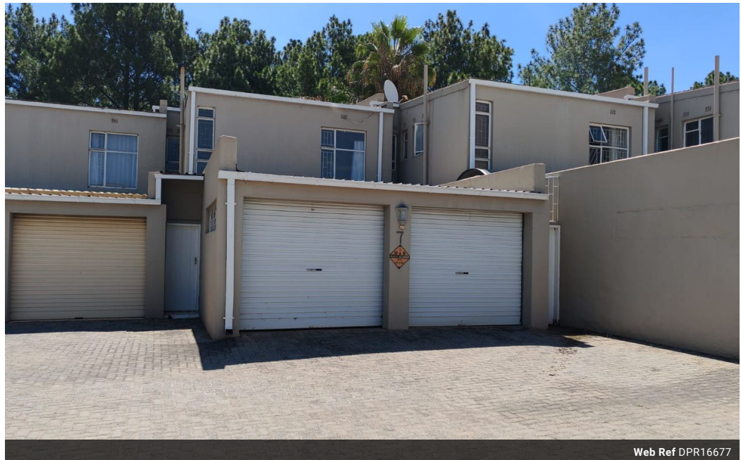
Web Ref DPR16677

18 Klipriver Drive Three Rivers Vereeniging