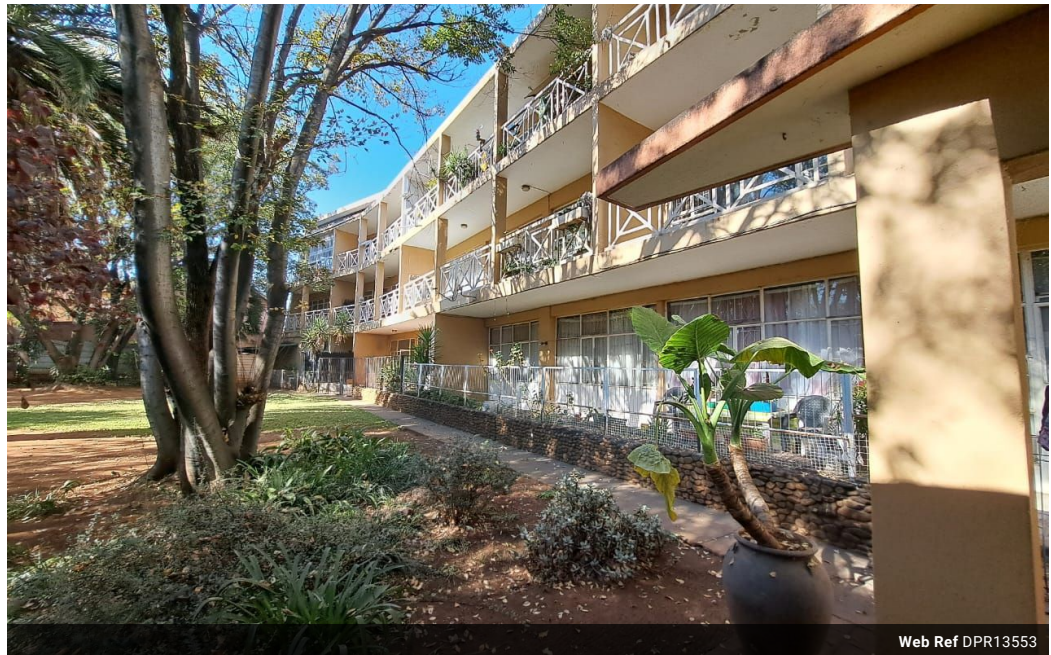
Web Ref DPR13553

18 Klipriver Drive Three Rivers Vereeniging