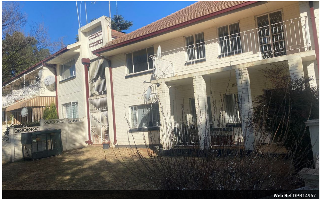
Web Ref DPR14967

18 Klipriver Drive Three Rivers Vereeniging