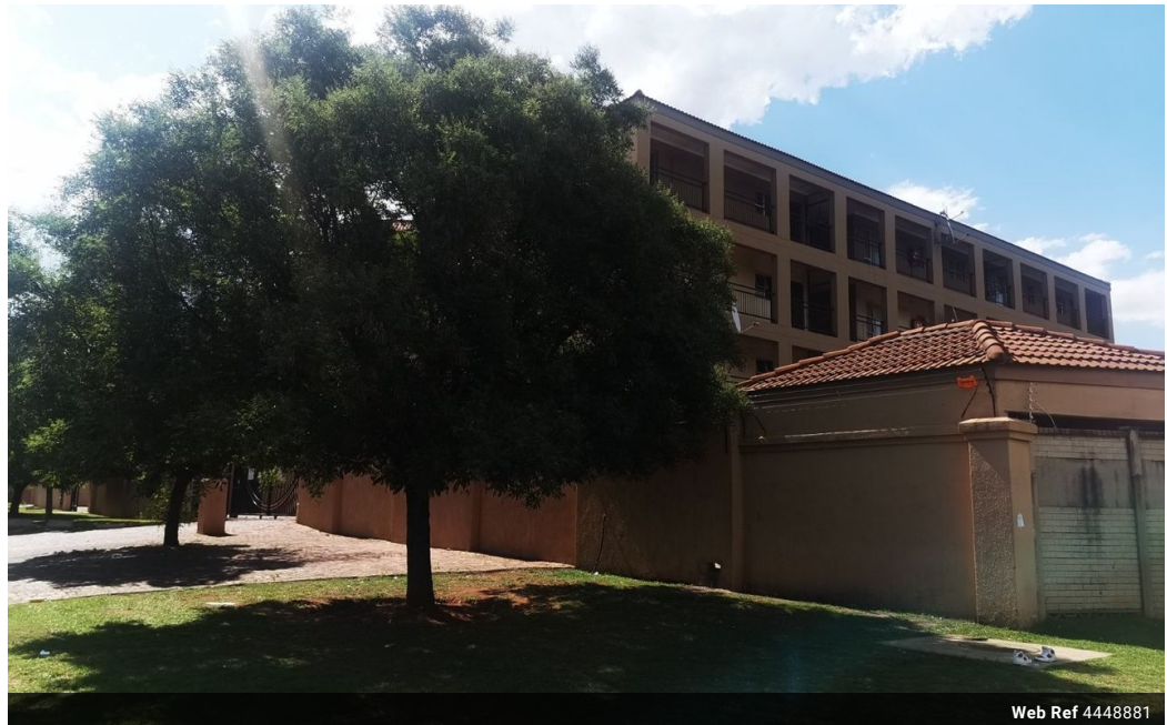
Web Ref 4448881

18 Klip River Drive, Three Rivers, Vereeniging