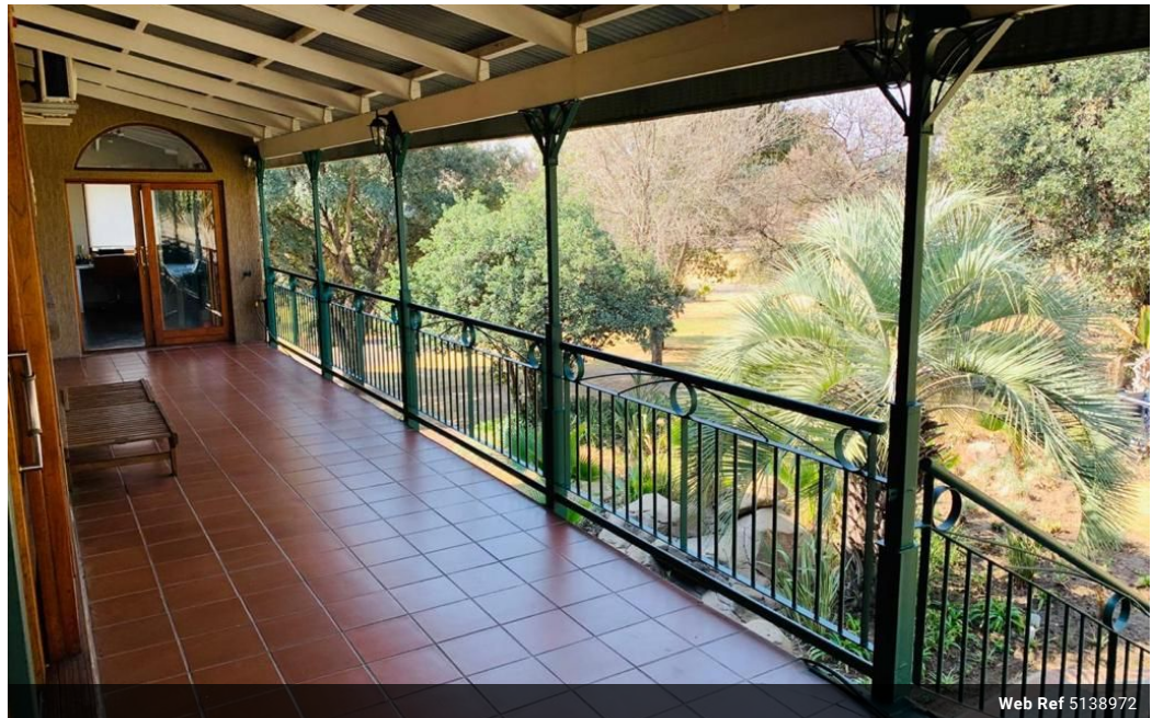
Web Ref 5138972

18 Klip River Drive, Three Rivers, Vereeniging