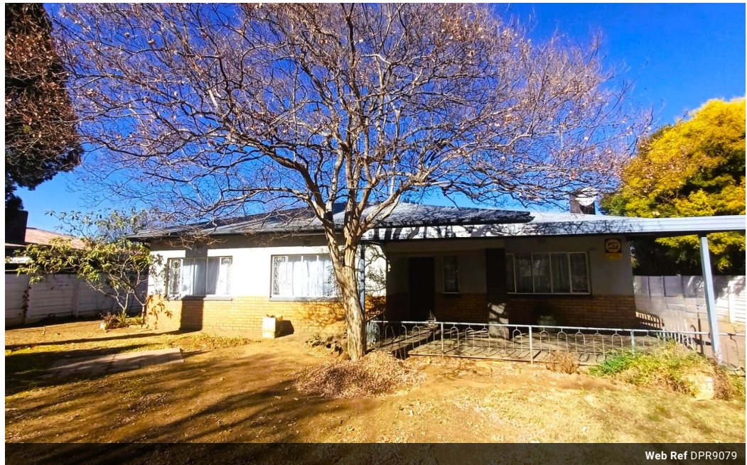
Web Ref DPR9079

18 Klipriver Drive Three Rivers Vereeniging