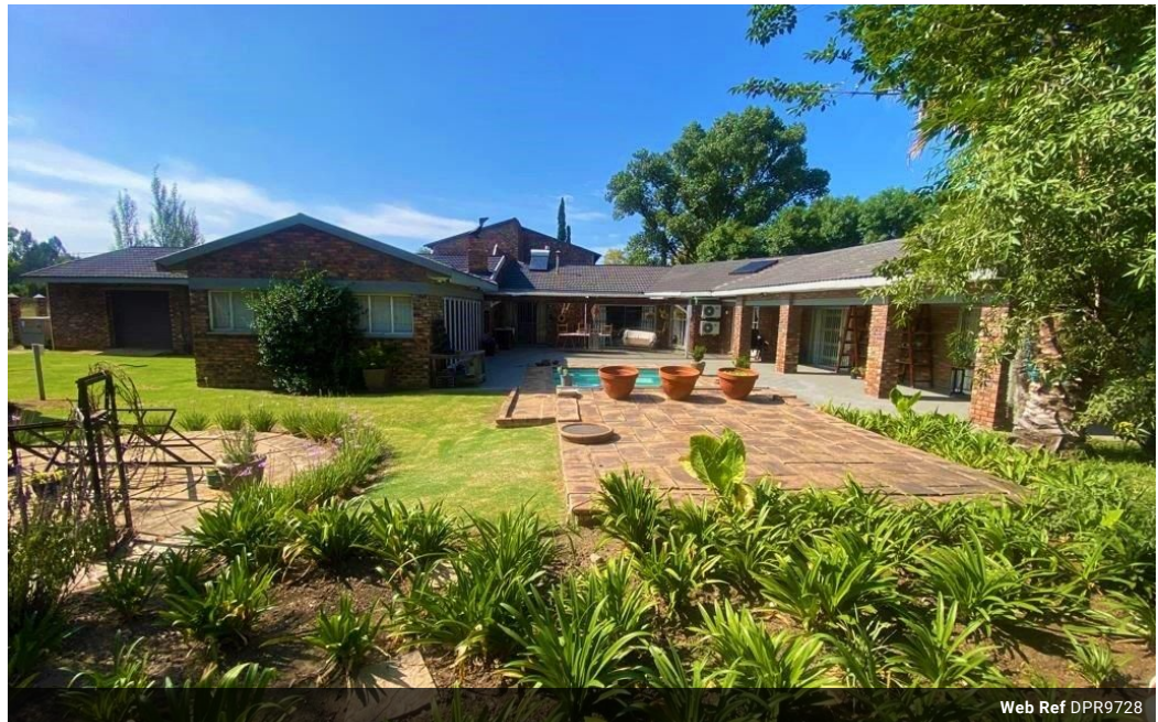
Web Ref DPR9728

18 Klipriver Drive Three Rivers Vereeniging