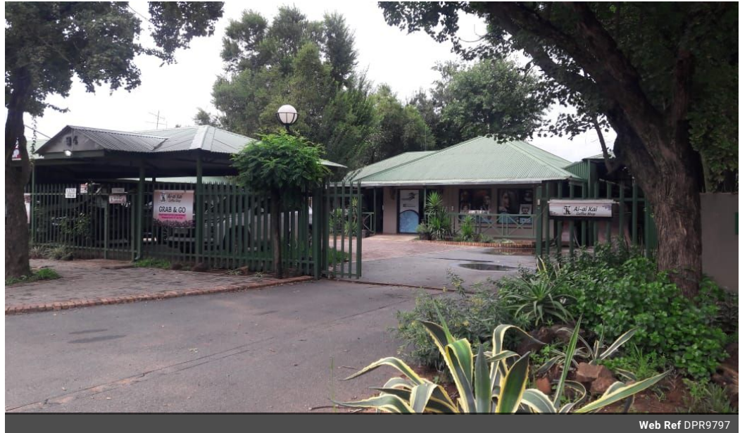
Web Ref DPR9797

18 Klipriver Drive Three Rivers Vereeniging