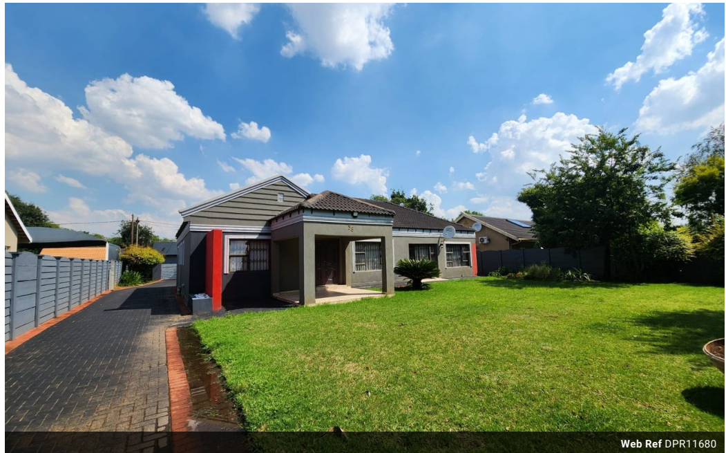
Web Ref DPR11680

18 Klipriver Drive Three Rivers Vereeniging