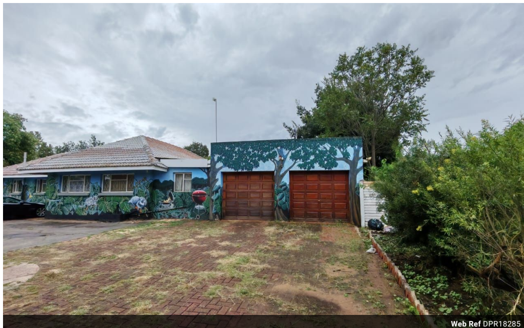
Web Ref DPR18285

18 Klipriver Drive Three Rivers Vereeniging