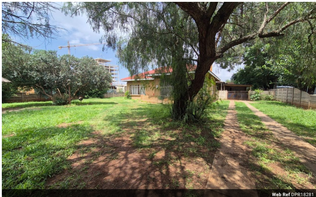
Web Ref DPR18281

18 Klipriver Drive Three Rivers Vereeniging