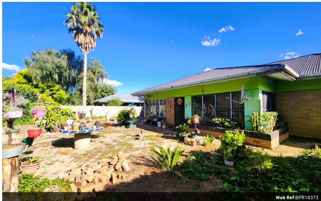
Web Ref DPR18373

18 Klipriver Drive Three Rivers Vereeniging