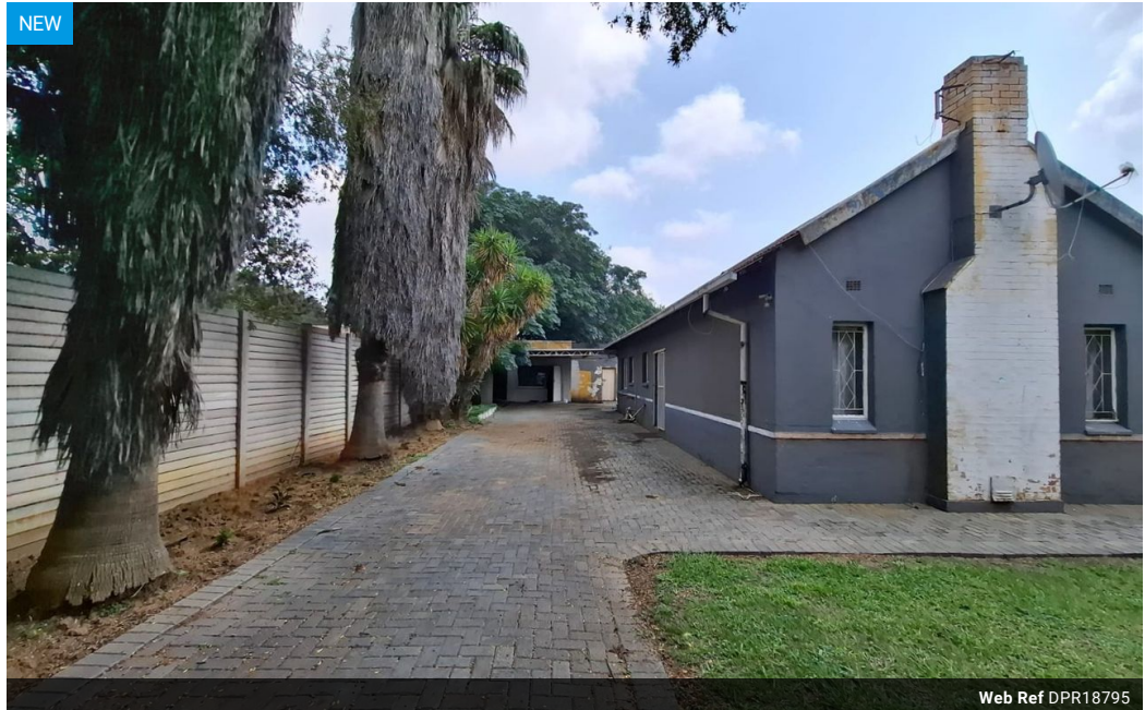
Web Ref DPR18795

18 Klipriver Drive Three Rivers Vereeniging