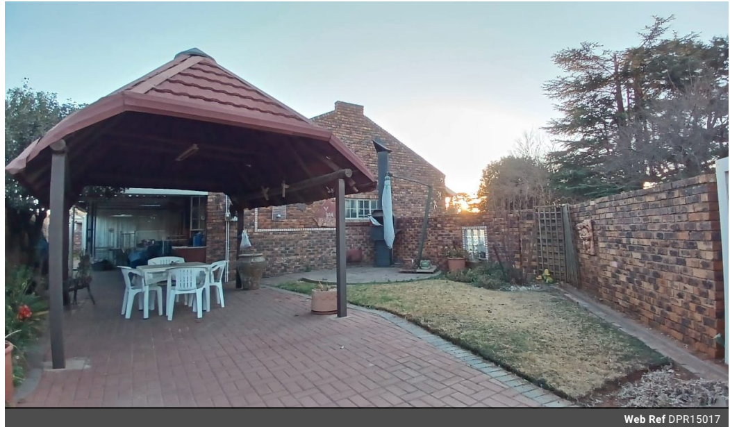
Web Ref DPR15017

18 Klipriver Drive Three Rivers Vereeniging