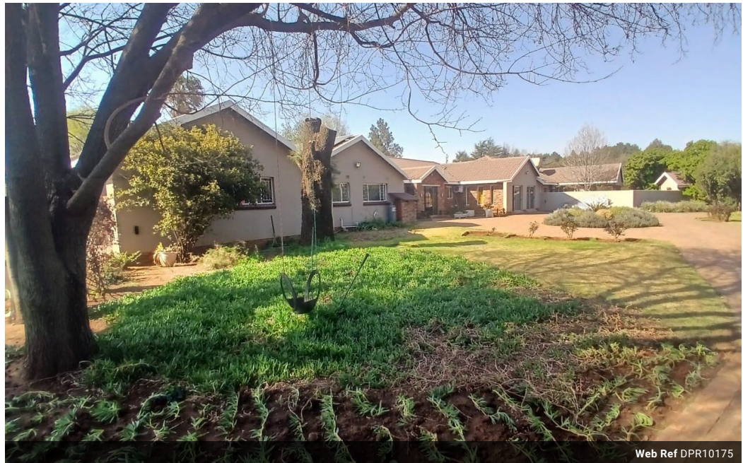
Web Ref DPR10175

18 Klipriver Drive Three Rivers Vereeniging