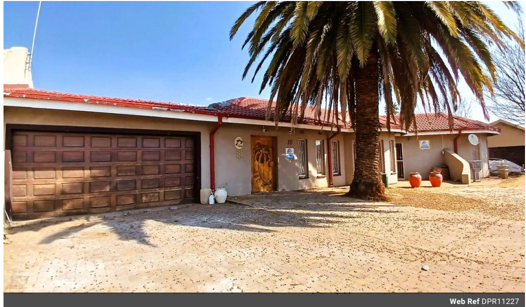
Web Ref DPR11227

18 Klipriver Drive Three Rivers Vereeniging