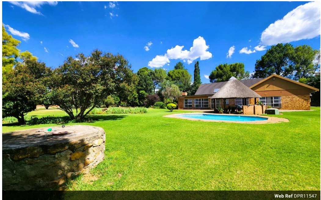
Web Ref DPR11547

18 Klipriver Drive Three Rivers Vereeniging