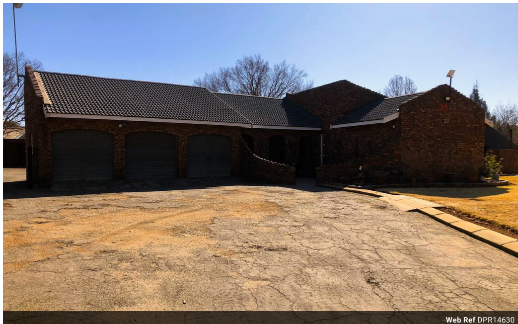
Web Ref DPR14630

18 Klipriver Drive Three Rivers Vereeniging