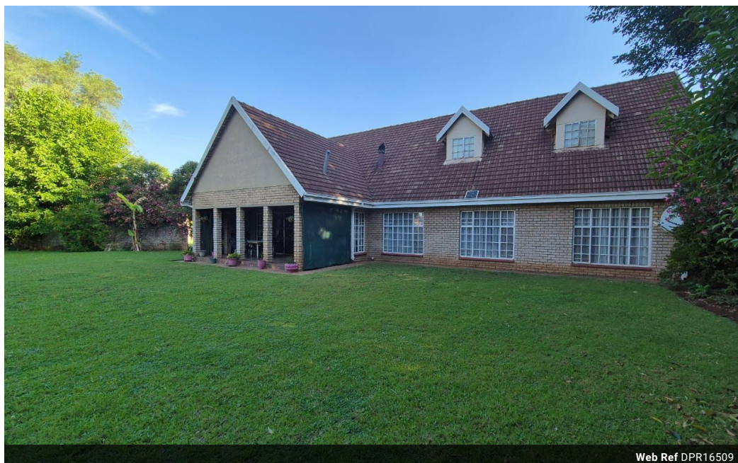
Web Ref DPR16509

18 Klipriver Drive Three Rivers Vereeniging