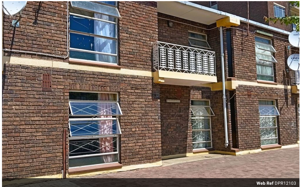
Web Ref DPR12103

18 Klipriver Drive Three Rivers Vereeniging