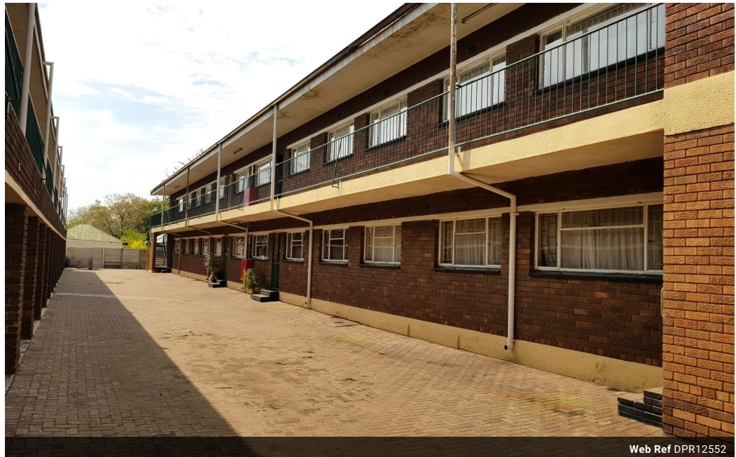
Web Ref DPR12552

18 Klipriver Drive Three Rivers Vereeniging