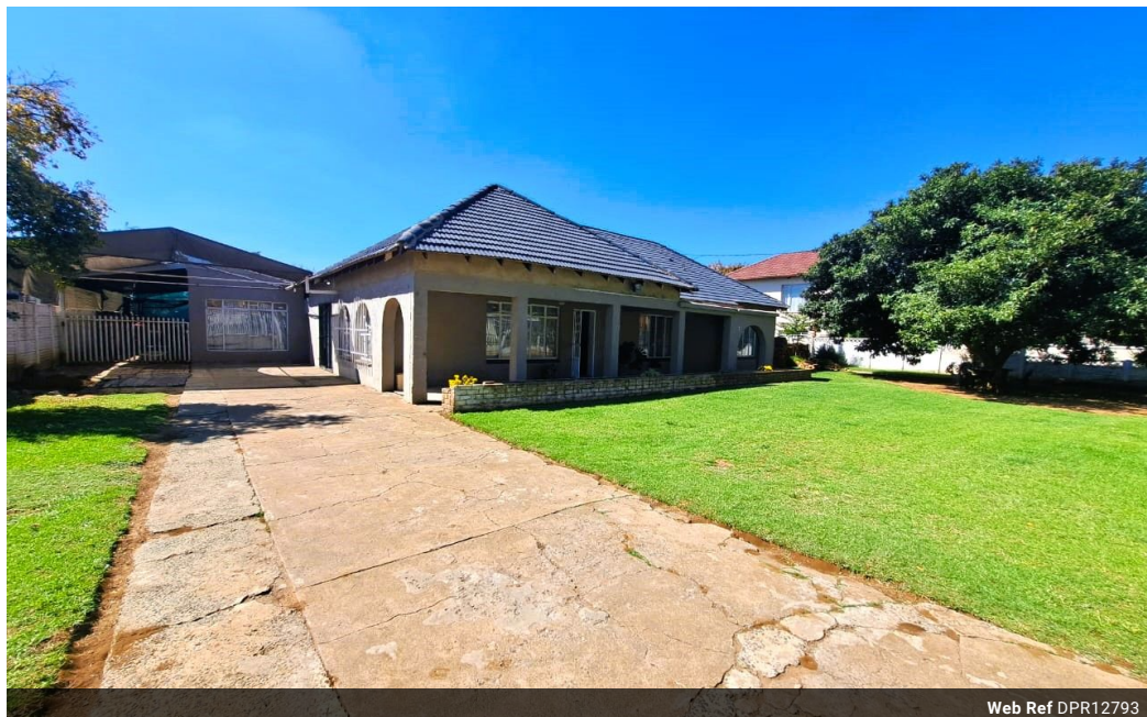
Web Ref DPR12793

18 Klipriver Drive Three Rivers Vereeniging