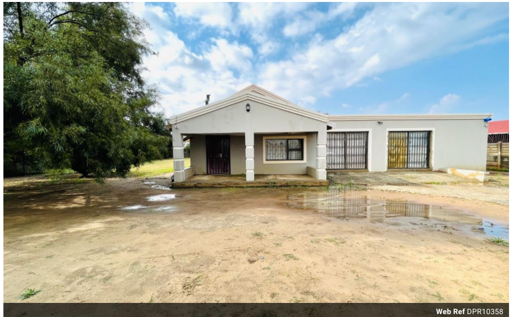
Web Ref DPR10358

24 Glynn Street Rothdene, Meyerton, 1961