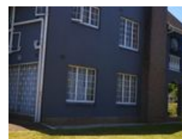
Web Ref DPR2028