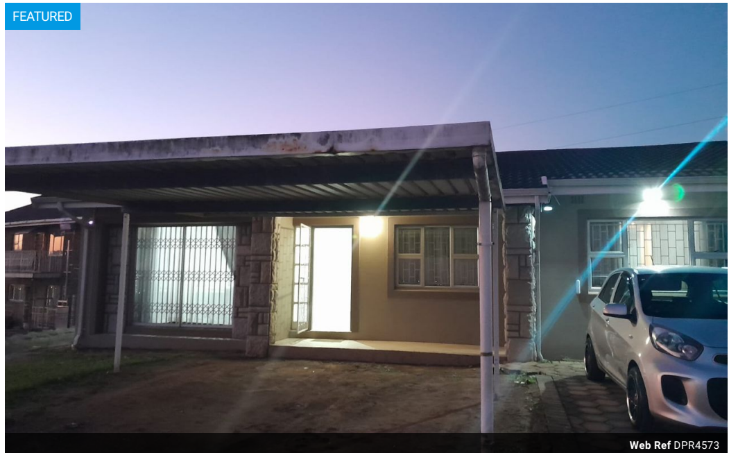
Web Ref DPR4573