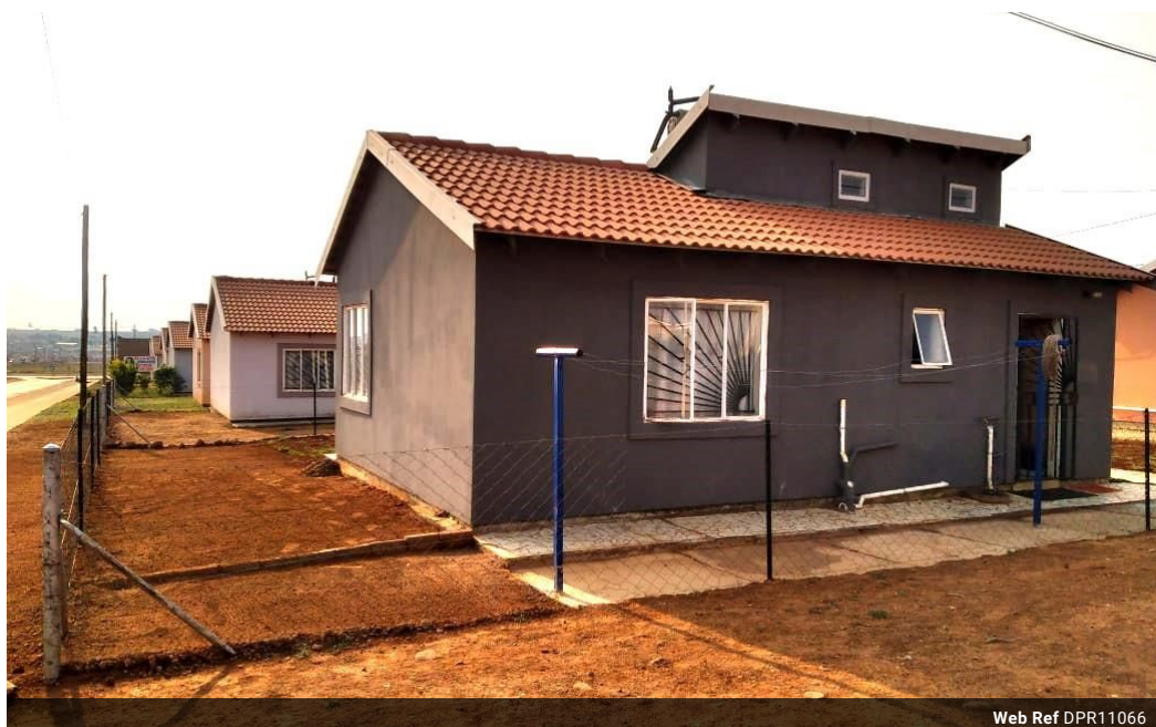
Web Ref DPR11066

18 Klipriver Drive Three Rivers Vereeniging