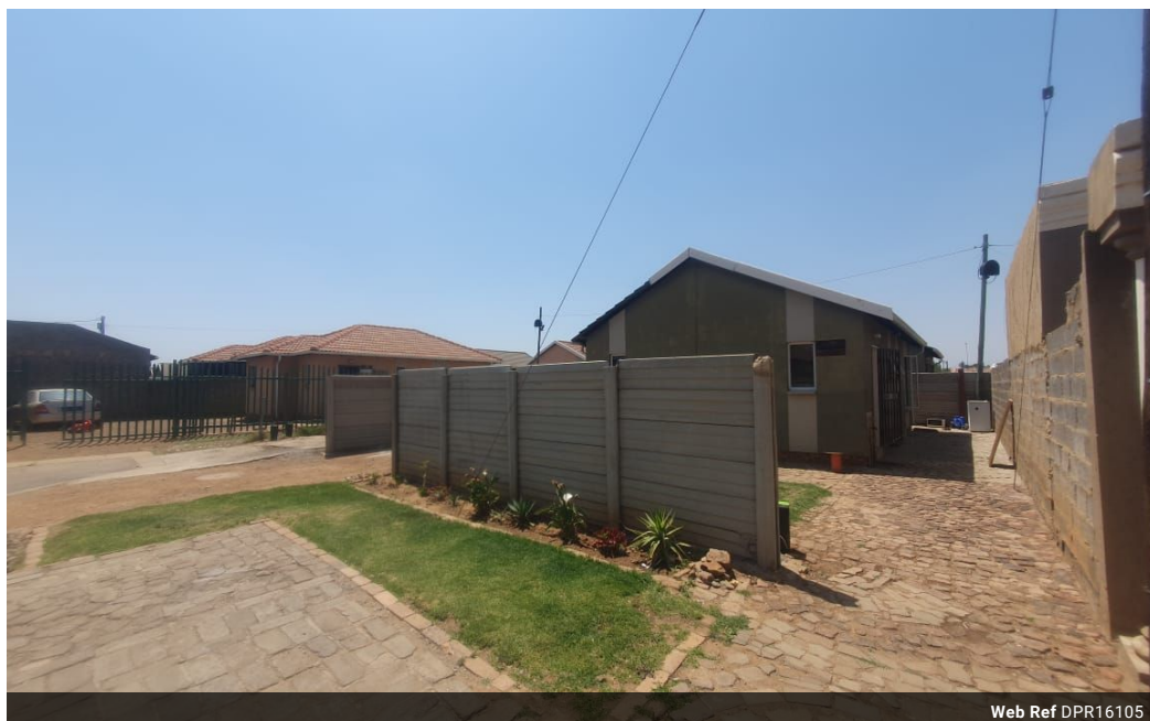
Web Ref DPR16105

24 Glynn Street Rothdene, Meyerton, 1961