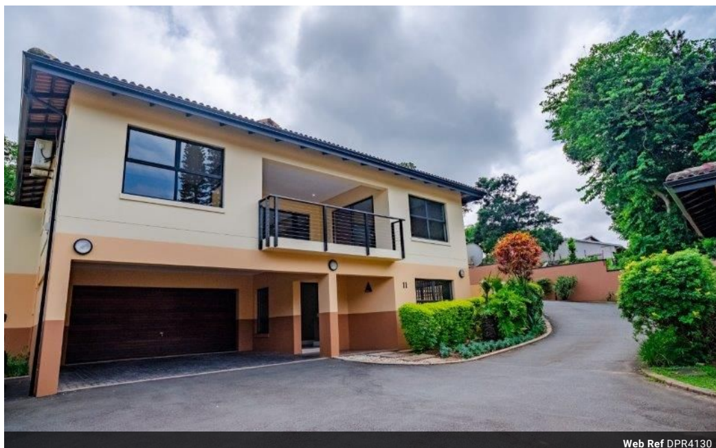
Web Ref DPR4130

1 Knightbridge, 16 Westville Road, Westville