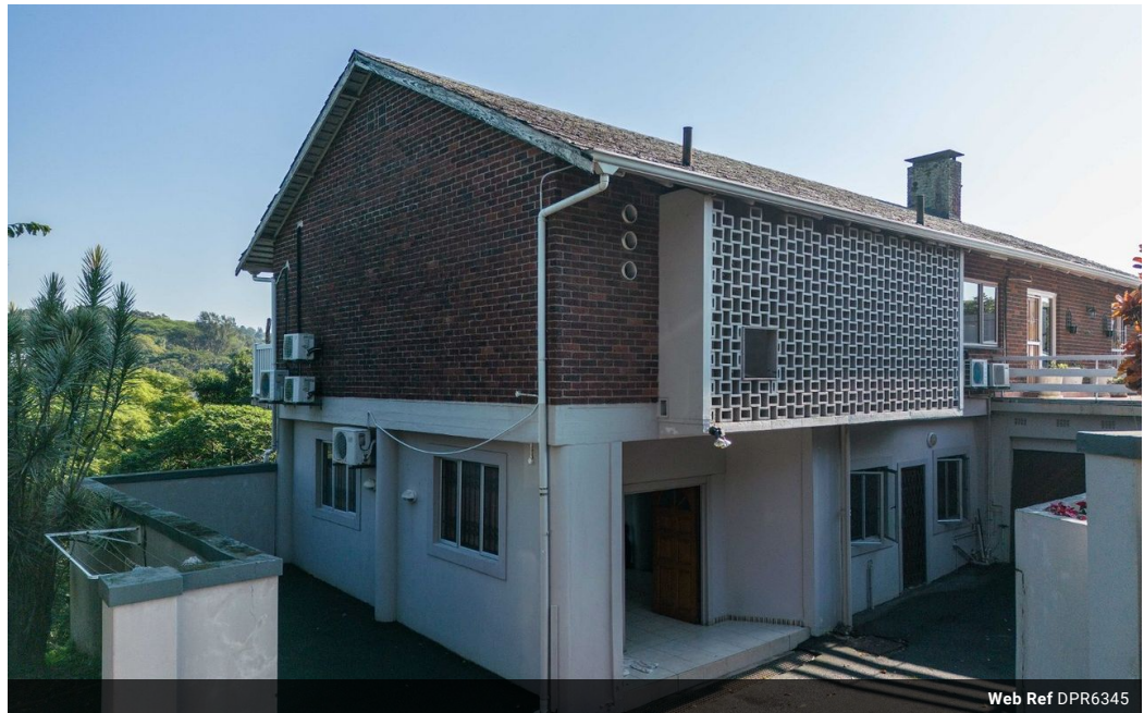
Web Ref DPR6345

1 Knightbridge, 16 Westville Road, Westville