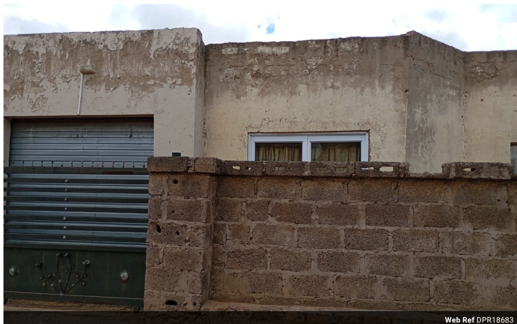
Web Ref DPR18683